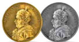
Stefan Batory Stephen Bathory (1576-1586)