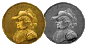
Władysław IV Waza Ladislav Vasa (1632-1648)