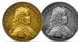
Michał Korybut Wiśniowiecki (1669-1673)