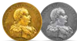
Jan III Sobieski John III Sobieski (1674-1696)