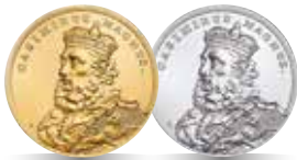
Kazimierz Wielki Casimir the Great (1333-1370) Date of issue: 3 III 2014