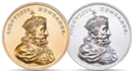
Ludwik Węgierski Louis I of Hungary (1370-1382) Date of issue: 10 IX 2014