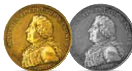
August II Mocny Augustus II the Strong (1697-1706, 1709-1733)