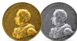
Stanisław Leszczyński (1705-1709, 1733-1736)