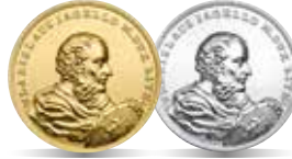
Władysław Jagiełło Ladislav Jagiello (1386-1434) Date of issue: 3 III 2015