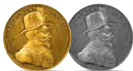
Zygmunt III Waza Sigismund Vasa (1587-1632)