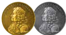
Jan Kazimierz Waza John Casimir Vasa (1648-1668)