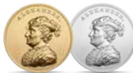
Aleksander Jagiellończyk Alexander (1501-1506) Date of issue: 7 XII 2016