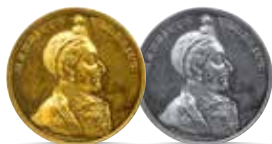
Henryk Walezy Henry Valois (1573-1575)