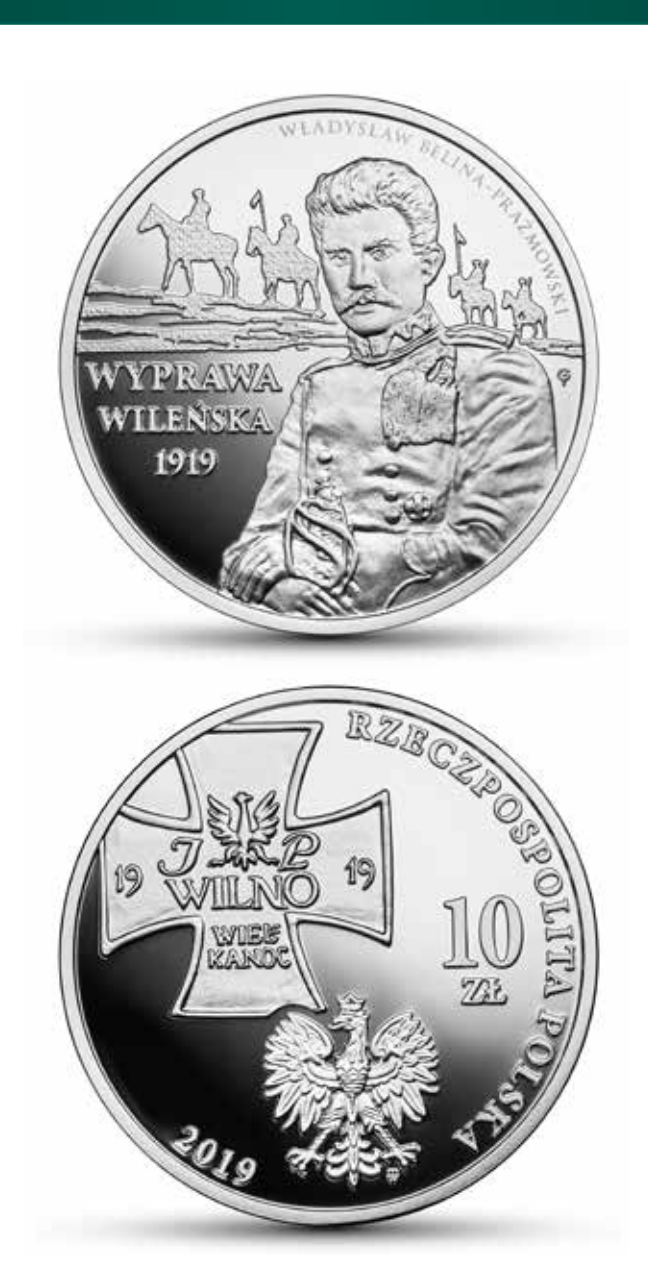
On 21 March 2019, Narodowy Bank Polski is putting into circulation a silver coin "Vilnius Offensive" with a face value of 10 złoty.

For the Bolsheviks, losing Vilnius was a great propagandistic and military failure. In Poland, the news of the city's liberation triggered an explosion of joy. The success was seen as a promise of a future victory in the war against Bolshevik Russia. The foray of Belina's cavalry to Vilnius was considered one of the most beautiful actions of the Polish cavalry in the wars of 1919–1920.