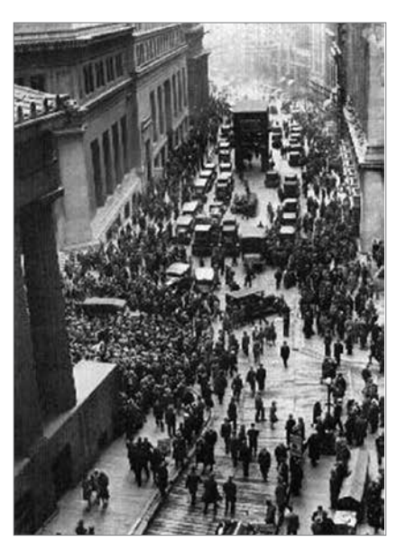
Crowds in front of the New York Stock Exchange The great depression, 1929.

The most well-documented examples of speculative bubbles occurred in the United States from the beginning of the 19th century to the great depression of the 1920s. The economy in the USA endured cyclical booms and busts on the local financial market. In the years 1819-1919 there were fourteen significant busts on the capital market, which also translated into a crisis in the economy. The mechanism was the same in each case: the pumping of the prices of assets popular at the given moment (that is, those which provided above-average rates of return on the invested capital), finally a turning point in this trend and then... a big bust. After a while, this mechanism was renewed and returned in the form of other assets popular at a given time. This was exactly how the