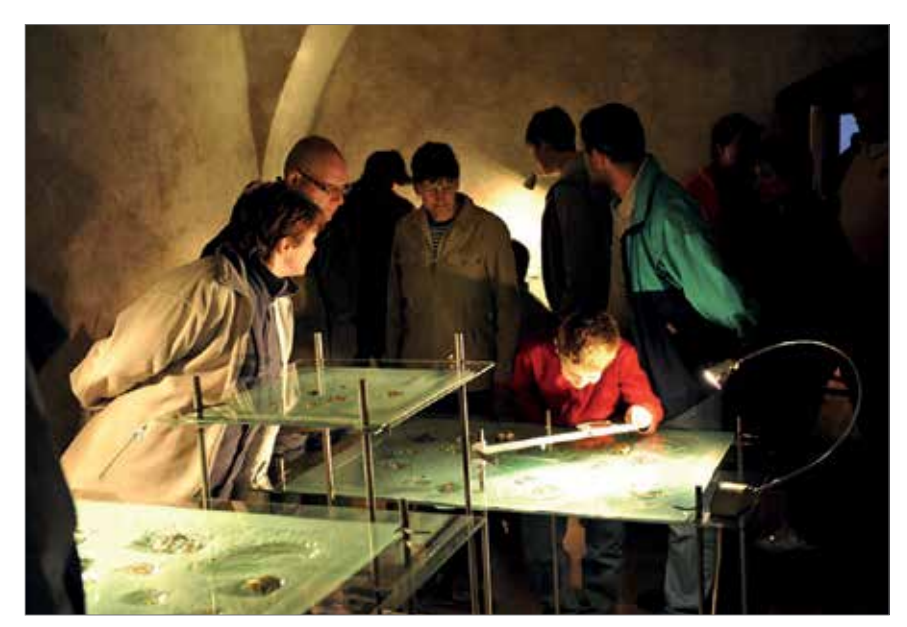
The exhibition entitled "Archaeological research in the Town Castle" was prepared for the European Night of Museums in Kremnica

The second museum exhibition presents the Town Castle of Kremnica. The castle consists of a medieval building-complex from the 14th–15th century. The dominant feature of the castle area is the Church of St. Catherine. Besides that the museum offers other history and art-history exhibitions in the castle complex. The Town Castle was opened to the public in 1996 after the extensive archaeological research and restoration of the castle area. In the same year, the NBS Museum of Coins and Medals was awarded the Annual Prize of the cultural magazine Monuments and Museums, issued by the Slovak National Museum.