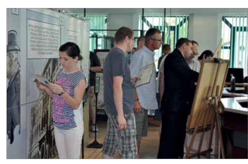
Guests of the Open Days visiting the exhibition – participants of the "Save the Polish gold" role playing game

Gold is an exceptional metal which has attracted the attention of people for centuries. This year was no different. The exhibited gold bar traditionally generated great interest, both among the customers of the bank and the people visiting the attractions prepared for the Open Days. We were aware, however, that very few people know the fascinating story of the evacuation of the Bank of Poland's resources during World War II. Therefore we were not surprised by the large number of visitors and the reaction of our guests to the exhibition entitled "The wartime fate of the Polish gold", prepared by the NBP Money Centre and constituting one of a series of educational