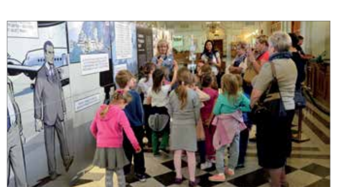
Six-year olds from the Municipal Preschool No. 146 in Łódź