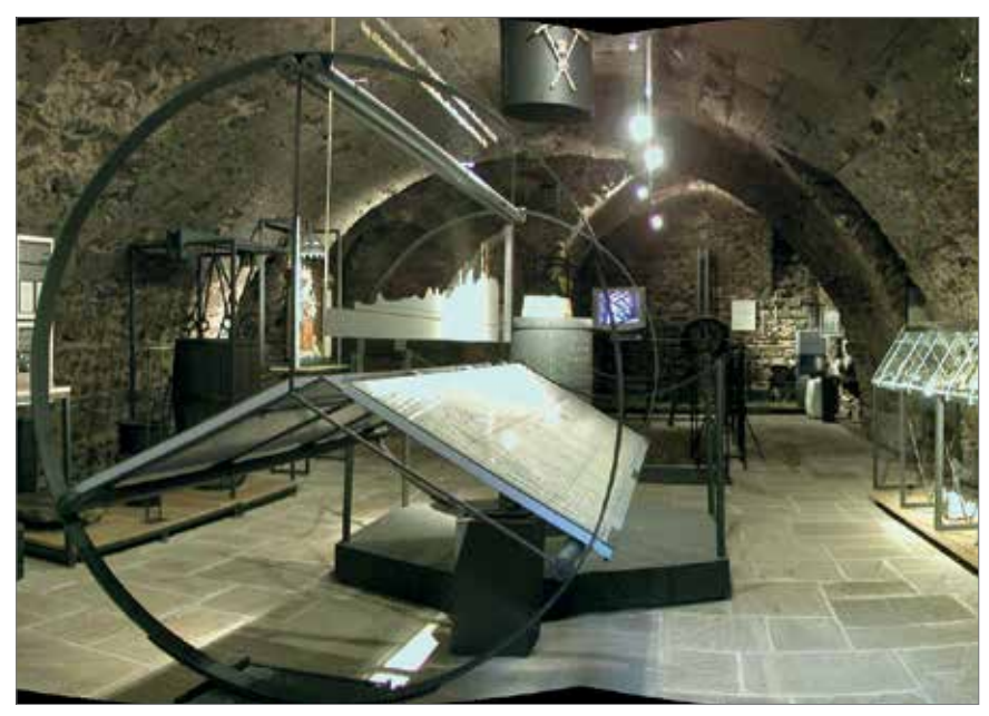
The history of mining and metallurgy in Slovakia is presented in the basement of the museum Collection of the NBS Museum of Coins and Medals

The main exhibition called Two Faces of Money – Money and Medal-Making in the History