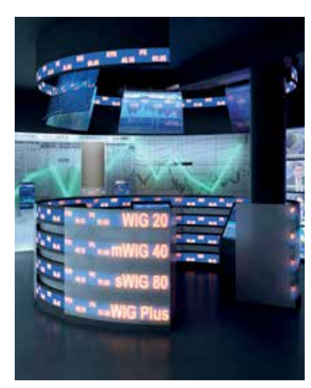
The "Stock exchanges" module Visualization by KiPP Projekt

The Centre will ensure the proper storage, cataloguing, conservation and constant replenishment of the collection.