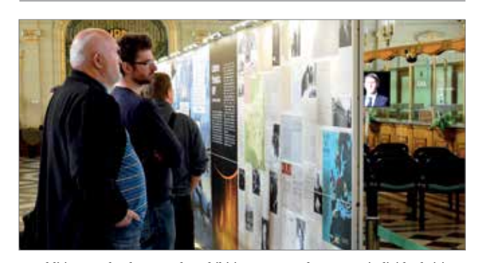
In addition to school groups the exhibition was popular among individual visitors