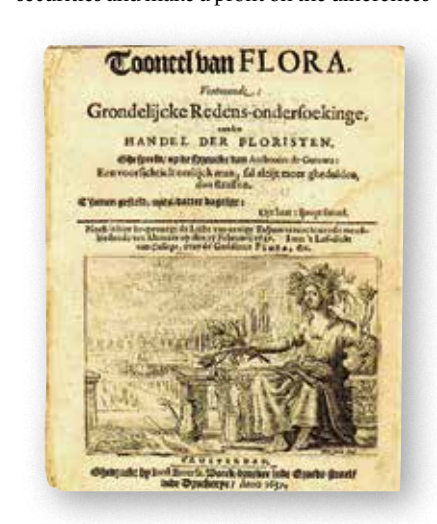
Pamphlet on the Dutch tulip mania

The capital market fulfils a number of important functions in the economy – It enables entrepreneurs who want to make investment to raise capital, which translates into the development of various branches of the economy and the growth of employment. On the stock market we can also trade in securities and make a profit on the differences