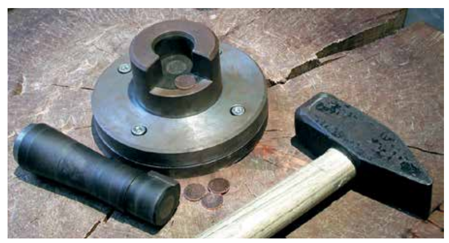
Visitors to the museum can strike a souvenir coin themselves

Museums or the Summer Night of Muses, whose programmes are enriched by theatre or music performances. In the Church of St. Catherine concerts are organized to mark