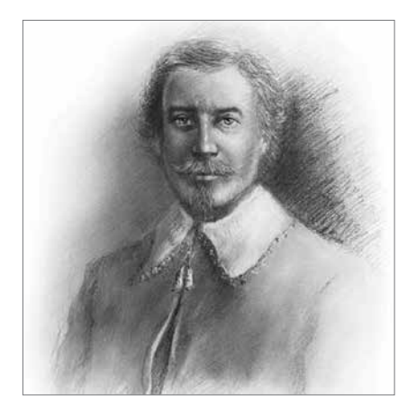
Jose De La Vega. Author of the oldest book on the stock exchange: Confusion of confusion, 1688