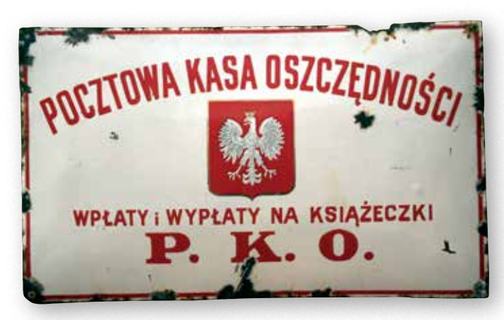
Sign from the 1930s NBP Collection

When the savings book emerged in the first decades of the 19th century, it was and remained a miniature of a banking book, where how much we owed and how much our contractors owed us was entered into the columns "Nostro" and "Loro". Both columns had to