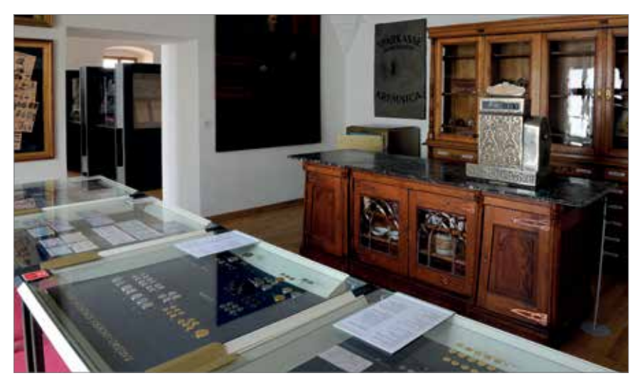
The exhibition of coins and banknotes from the territory of Slovakia Collection of the NBS Museum of Coins and Medals

The museum prepares all kinds of cultural events for the public. Visitors can discover the hidden treasures of the museum collections during special tours like the Night of