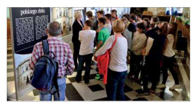
Secondary school youth from Łódź