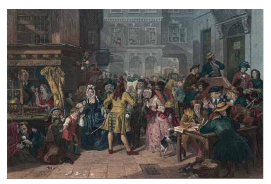
Image from the collection of the Tate Gallery in London. E.M. Ward: South Sea Bubble, 1846

were used purely for risk management. Today we know them under the name of derivative instruments.