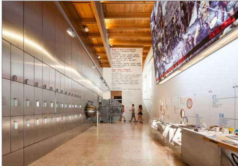
The hall in which visitors can buy souvenirs.

The former church building is a major focal point of the museum, for it is a unique, totally refurbished building that presents Lisbon's 18th century architecture. The architectural aspect is fully explored in the material of the Museu do Dinheiro.