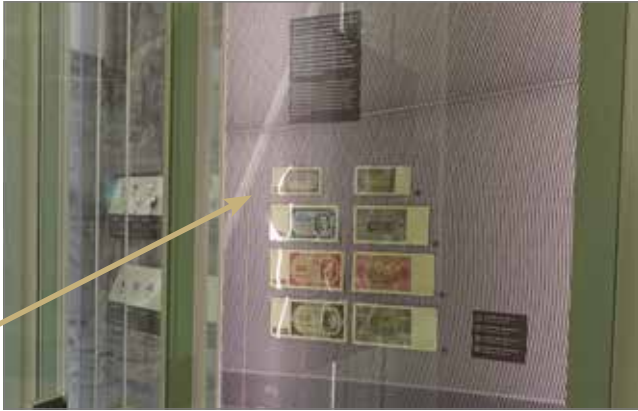
CENTRAL BANK room. Glass showcase with the 2 zloty banknote.

this was the only banknote whose graphic design did not fit in with the socialist realism movement already coming from the East.