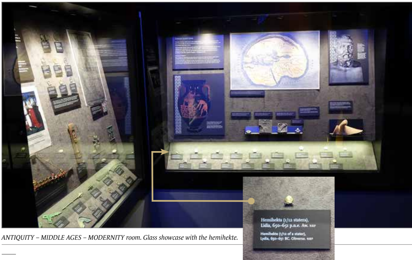
ANTIQUITY – MIDDLE AGES – MODERNITY room. Glass showcase with the hemihekte.

set at 1:13. One of the problems in settlements resulted from the use of natural lumps of Electrum, in which the gold and silver ratio varied, and could range from 17% to even 30% of silver content. In order to remedy these inconveniences and to unify the monetary system, the Lydian rulers adopted a solution which facilitated settlements in Electrum. The symbol of the ruler struck on a lump of