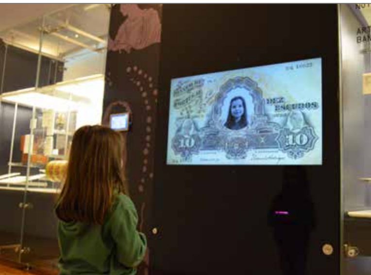
A 10 escudos banknote which visitors can design with their own portrait thanks to multimedia technology.