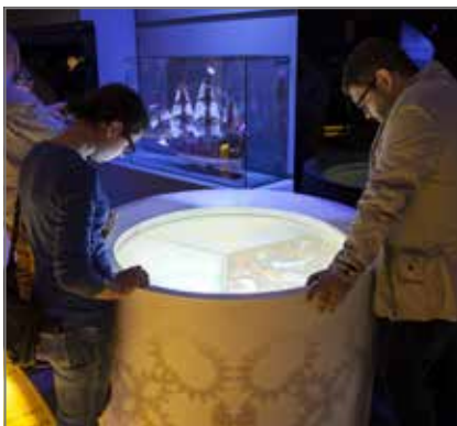
The multimedia “wells” are virtual windows of time in which several people can become acquainted with the history of money.