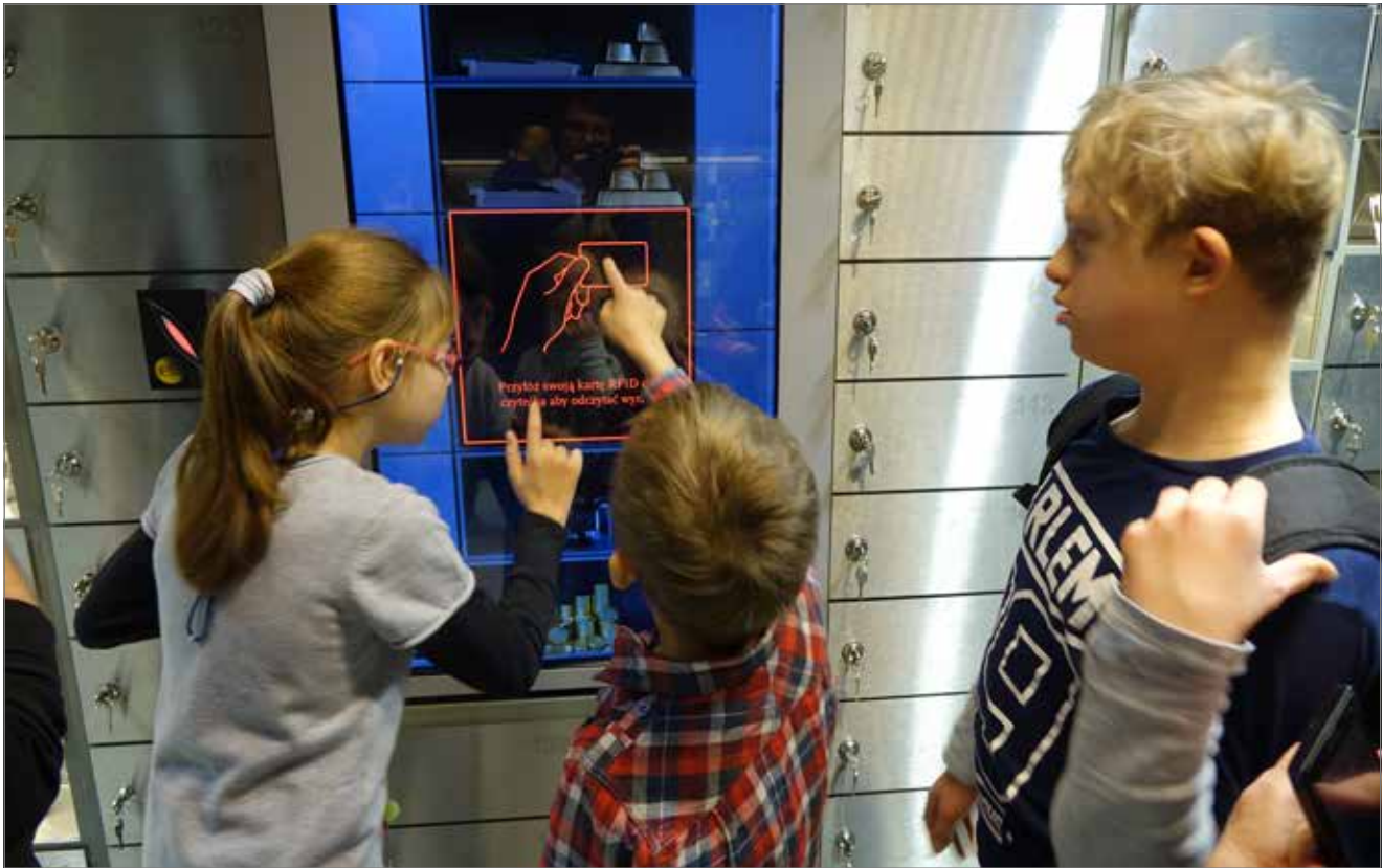
The photos present the students of the “Give a Chance” School Complex in Warsaw.

was preceded by an architectural audit and a visit of persons with disabilities, who checked whether other solutions associated with the transfer of knowledge and information on a given topic were also created with consideration, for example, for visitors with impaired sight or hearing (this type of visitation is carried out in all cultural institutions).