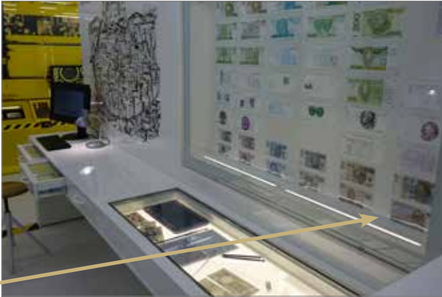
CREATOR of MONEY and MONEY PRODUCTION room. Glass showcase with 500 zloty banknote.

The 500 zloty banknote has modern security features which, apart from their high technological level, also ensure easy identification and good functionality.