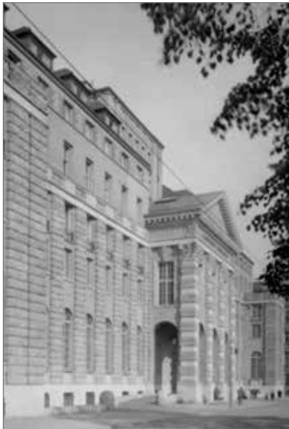
Postwar NBP head office at 50 Nowogrodzka Street in Warsaw.

By May 1946, the banknotes introduced into circulation included the denominations of 1, 2, 5, 10, 20, 50, 100, 500 and 1,000 zł. Banknotes of the highest denominations (100, 500,