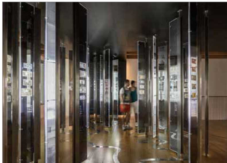
1200 exhibits presented in 140 showcases in 2,000 m 2 of floor space.