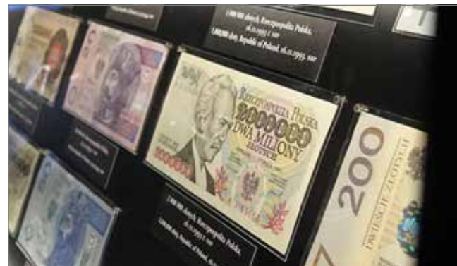
TRANSFORMATION room. Glass showcase with the 2,000,000 zloty banknote.