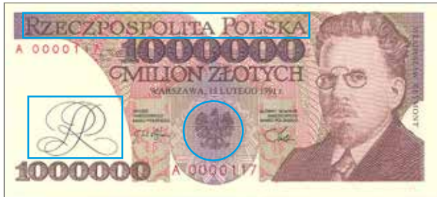
Banknote with a denomination of 1,000,000 zloty and a date of issue of 15 February 1991. In the watermark (in the unprinted field) we can see the image of the eagle from the emblem of the Polish People's Republic – without a crown, even though the banknote bears the name “Rzeczpospolita Polska”, the abbreviation of the state name “RP” and the emblem of the Republic of Poland – an eagle with a crown.