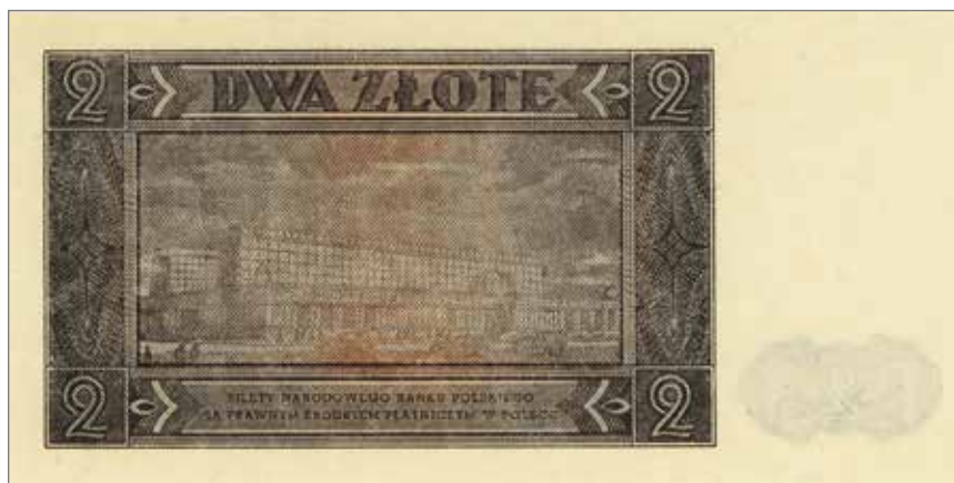
CENTRAL BANK room. 2 zloty, issue from 1 July 1948.

coins facilitated small payments and were used in pay phones.