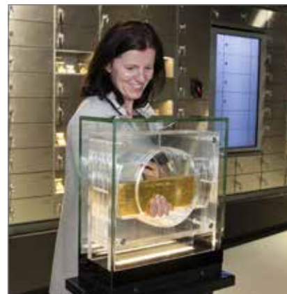
An exhibition cannot consist of multimedia items alone. There is no substitute for contact with real physical exhibits, which is best evidenced by the gold bar that can be touched by every visitor to the NBP Centre Money.

Is it possible, therefore, to create a good exhibition without multimedia elements? Probably yes, but for today's youth the world is a land of computers. Thus an exhibition without multimedia elements has no justification in today's reality and makes young people uncomfortable if it doesn't present unique and interesting contents through the exhibits alone. There is a catch, however, that we should not forget about. Multimedia elements cannot be the only platform of communication, because enabling contact with real exhibits is the main objective of any museum or educational facility such as the NBP Money Centre. They provide the perfect support for the real exhibition, allowing us to show processes and the functioning of various phenomena using animation – in our case these are, for example, the basics of finance or economics and the history of the development of monetary transactions since ancient times (barter) to the present (electronic payments). Multimedia items perfectly complement the contents of the showcases, allowing