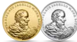
Władysław Jagiełło Ladislav Jagiello (1386–1434) Date of issue: 3 III 2015