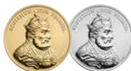
Zygmunt I Stary Sigismund the Elder (1506–1548) Date of issue: 12 VII 2017