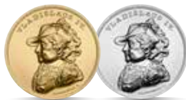
Władysław IV Waza Ladislav Vasa (1632–1648) Date of issue: 3 XII 2020