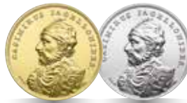
Kazimierz Jagiellończyk Casimir Jagiellon (1447–1492) Date of issue: 3 XII 2015