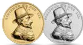
Zygmunt III Waza Sigismund Vasa (1587–1632) Date of issue: 23 I 2020