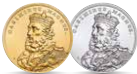
Kazimierz Wielki Casimir the Great (1333–1370) Date of issue: 3 III 2014