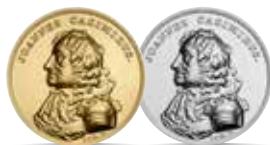
Jan Kazimierz Waza John Casimir Vasa (1648–1668) Date of issue: 26 I 2021