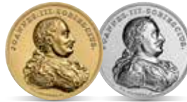
Jan III Sobieski John III Sobieski (1674–1696) Date of issue: 9 II 2022