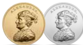
Aleksander Jagiellończyk Alexander (1501–1506) Date of issue: 7 XII 2016