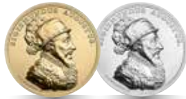
Zygmunt August Sigismund-Augustus (1548–1572) Date of issue: 7 XII 2017