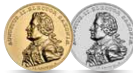
August II Mocny Augustus II the Strong (1697–1706, 1709–1733) Date of issue: 1 XII 2022