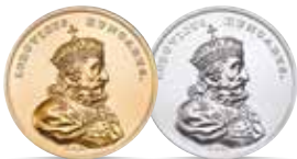
Ludwik Węgierski Louis I of Hungary (1370–1382) Date of issue: 10 IX 2014