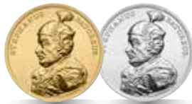
Stefan Batory Stephen Bathory (1576–1586) Date of issue: 17 I 2019