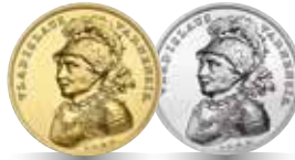
Władysław Warneńczyk Ladislav of Varna (1434–1444) Date of issue: 15 IX 2015