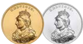
Jadwiga Andegaweńska Jadwiga of Anjou (1384–1399) Date of issue: 4 XII 2014