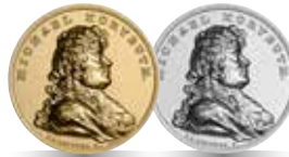
Michał Korybut Wiśniowiecki (1669–1673) Date of issue: 2 XII 2021