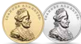
Jan Olbracht John Albert (1492–1501) Date of issue: 14 VI 2016