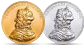
Wacław II Czeski Vaclav II (1291–1305) Date of issue: 22 V 2013